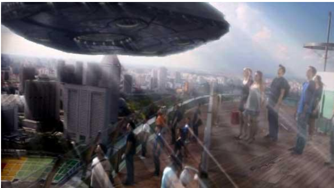
Illustration 2: The Visitors Provide Bliss for Humanity From the television series “V,” 2009.

“Clearly, psychotronic weapons already exist; only their capabilities are in doubt. That is not to say that problems do not exist with the weapons and the concepts. At the present time, unpredictable systems failure and difficulty in controlling testing are major weaknesses.” 34