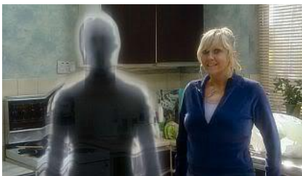
Illustration 3: The Ghost Shift Doctor Who , “ Army of Ghosts ”

“Seeing is believing,” right? If you are making plans to control the spirit of an evolving species, that necessitates being able to create convincing imagery —not just in the sky, but in the minds of those you wish to control. It is not a new theme; it has been used on the BBC series, Doctor Who , a number of times, from the “ghost shift” from the Season 28 episode, “ Army of Ghosts ,” 38 all the way back to the 1968 episode, “ The Invasion ,” 39 where the Cybermen added a “micro monolithic circuit” to the then popular transistor radio that allowed them to take control of human minds, via the “cyber control signal” beamed from space.