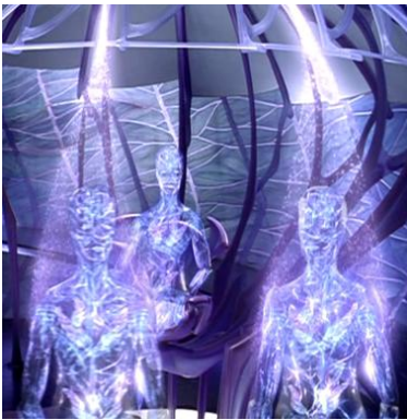
Illustration 1: The Taelon Earth Final Conflict

Back in 1994, Canadian journalist Serge Monast (deceased) wrote an exposé on a secret NASA project known as Blue Beam . These Air Force types do like the blue symbolism, as they deal with the sky. But let’s take a look at some older symbolism, first, to see if we spot any other meaning.